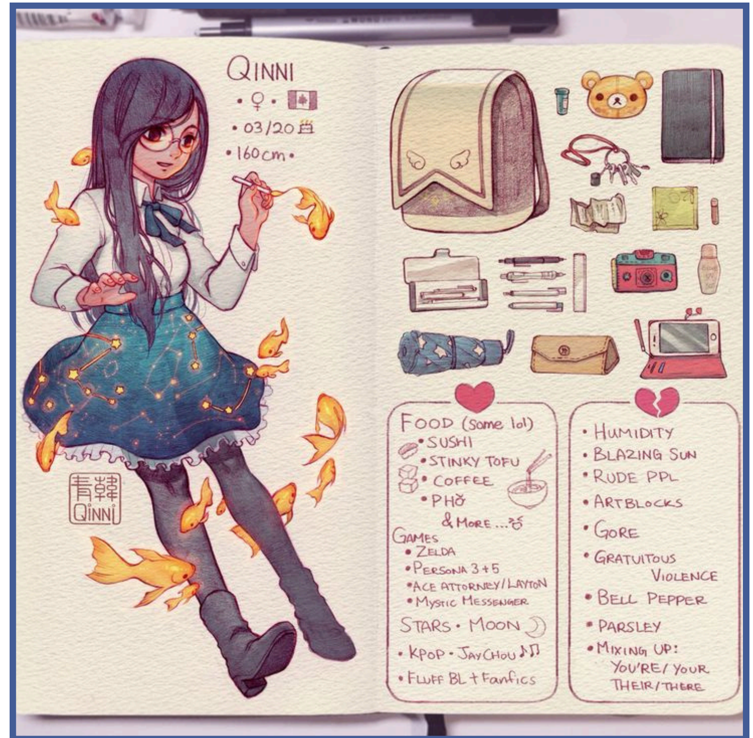
QINNIART ON INSTGRAM