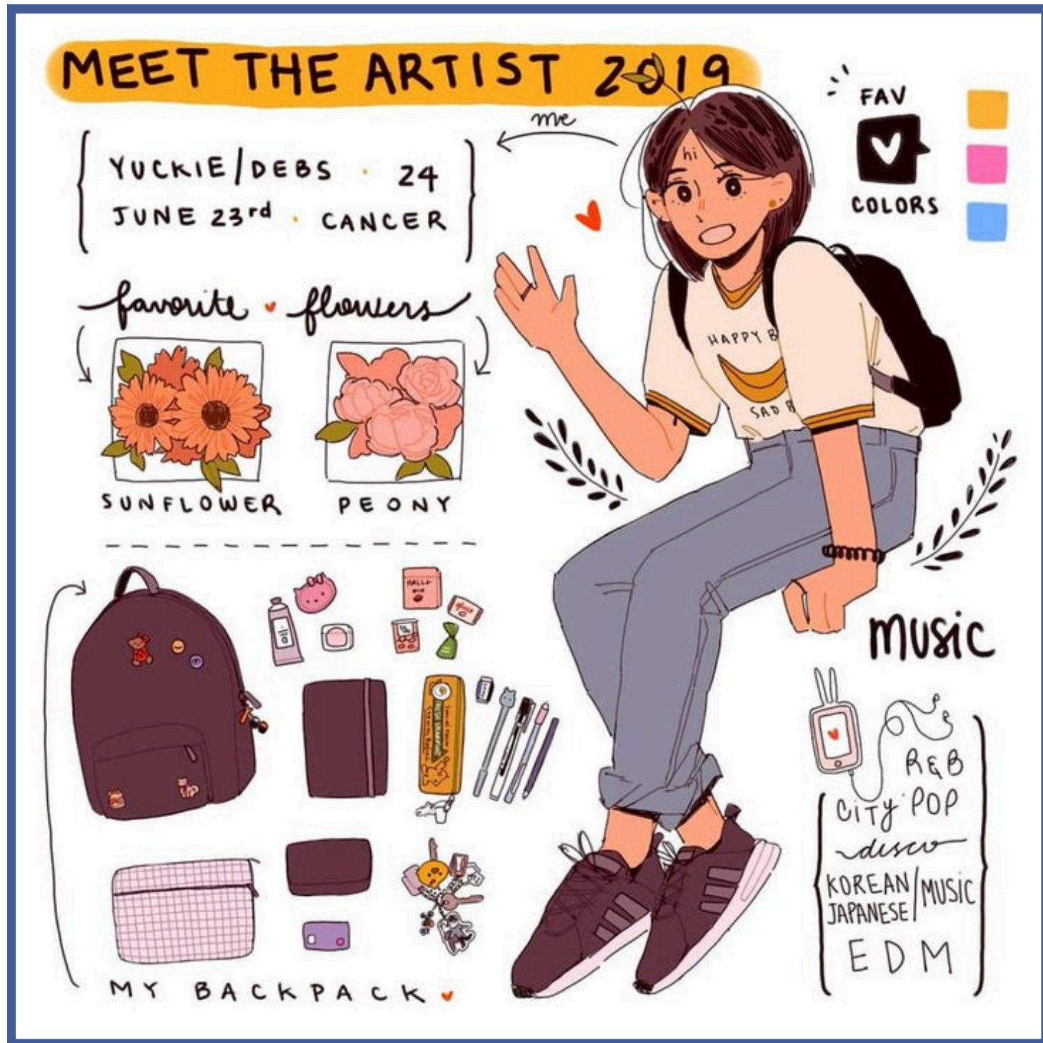
KIRAIXSUKI ON INSTAGRAM