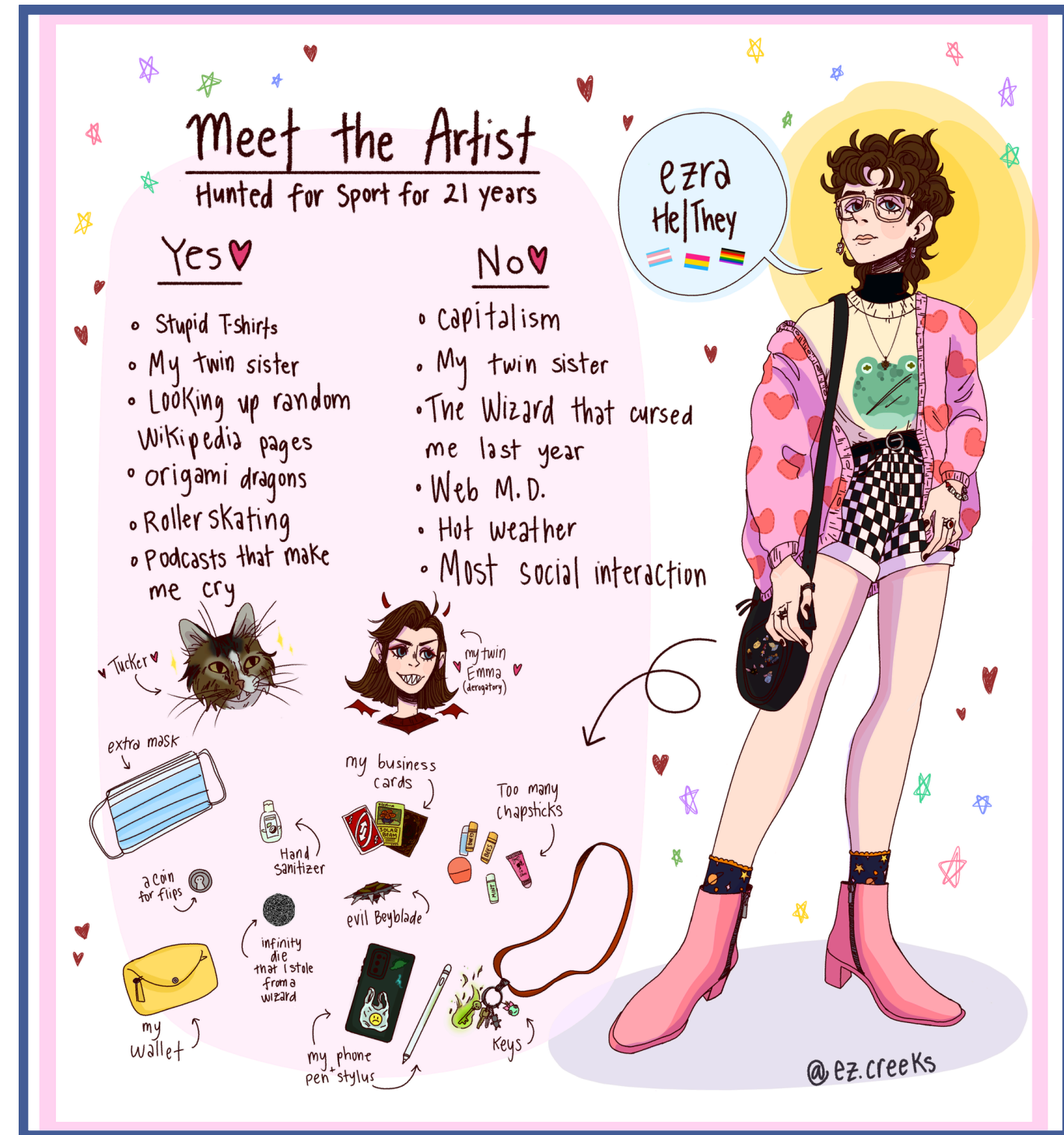
EERIE ON ART STREET